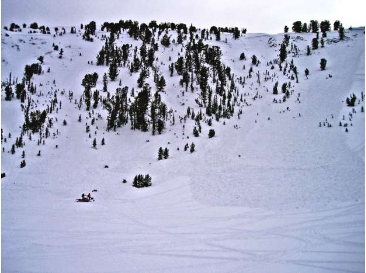
Fatal avalanche in Brodie Gulch. Highmarks entering the avalanche are visible on the right side of the photo. The victim was found near the people in the lower left.