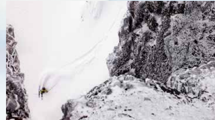
Axel Peterson